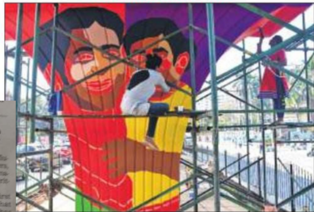
Members of the transgender community can be seen painting a pillar of a Worli flyover on Monday.